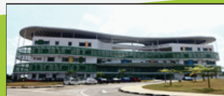
BLOCK C22, UTM JOHOR BAHRU, JOHOR, MALAYSIA

Lecturers / Researchers Students (Postgraduate / Undergraduate) Professionals